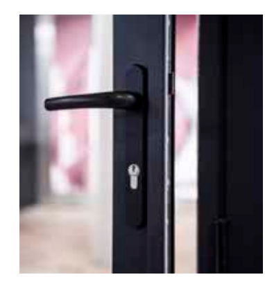
BSF70 HI Bifold – Traffic Door Handle

Of course, added strength and security should never compromise style. And certainly never function. It's why our hardware products not only improve ease of operation for years to come, but deliver a timeless look and finish.