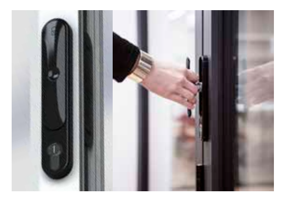
BSF70 HI Bifold – Locking T-Handle

Our tested, tried and trusted hardware range includes suited handles, locks, hinges, rollers, bogeys, seals and brushes. Each and every product has to pass our famously stringent tests, with most subjected to 50,000 operational cycles to emulate a lifetime of trouble-free operation. Then the real testing begins.